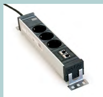
Power socket blocks