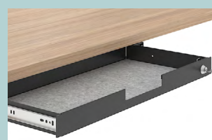
Felt-lined metal drawers with lock