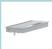
Metal grommet: 317x119 mm, H=27 mm